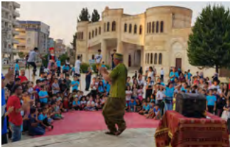
Flying Carpet festival for (mostly Kurdish) Turkish and Syrians, Nusaybin, Mardin, SE Turkey - Sirkhane