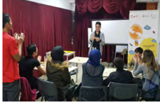
Syrians & Turkish children, Istanbul - ASAM