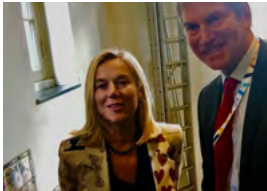
With Minister Sigrid Kaag

High level networking opportunities occurred in the Mental Health and Psychosocial Support International Conference spearheaded by Minister Sigrid Kaag of Netherlands. Also at the Global Salzburg Seminar in Education for Refugees and Migrants, and in various schools and at the annual convention of the International Brotherhood of Magicians.