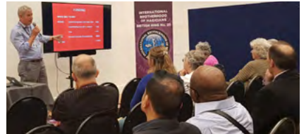
Talk at International Brotherhood of Magicians