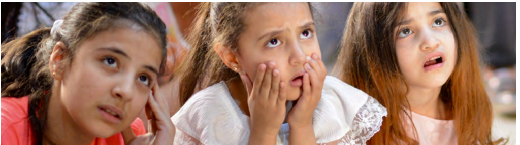
Wonder of magic Palestinian & Jordanian children, Resife, Amman, Jordan – STEPS (and partner JHHB)