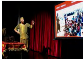
Fundraising at Barnfield, Exeter