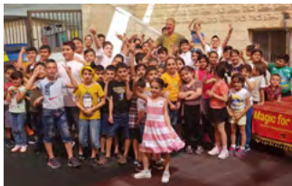
Thankful Iraqi children after the show - Good Shepherd School, Amman, Jordan