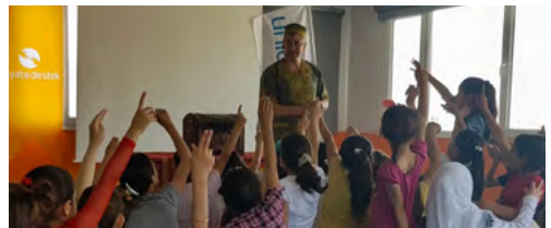
Syrians Hatay close to Syrian border, Turkey - Support to Life