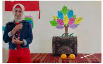
Syrian girl talks on the benefits of magic, Zaatari camp, Jordan