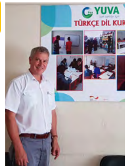
After show with YUVA, Kirachan, Turkey

Contacts: hello@magicforsmiles.com +961 76045717 / +44 7366 119778 @MagicForSmiles www.magicforsmiles.com