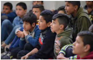
Transfused Palestinian & Jordanian children, El Hussein camp, Amman, Jordan - STEPS

Even with one-off exposure the experience of magic can have impact for a long time acting as a reference point for analysis and discussion. Impact on concentration and analysis levels is self-evident with relatively undisciplined children becoming unusually focused. Measuring impact on levels of imagination is difficult but the life injected into children experiencing magic is a good indicator.