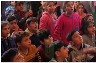
Wonder and concentration amidst Syrian children, Amman, Jordan - Collateral Repair Project