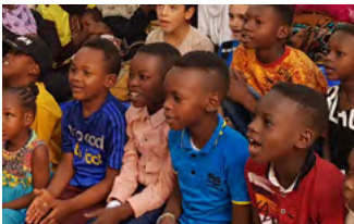
Loving the magic, mainly Sudanese children, Amman Jordan - Collateral Repair Project

With the Syria conflict in its ninth year many refugees from Syria know nothing except life in camps or poverty and stress, are traumatised themselves, or absorb the levels of trauma they hear from their parents. Refugees from Yemen and Iraq, especially present in Jordan, also suffer the consequences of war like Syrian children, and in many cases more recently.