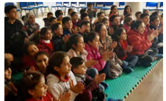
Syrian children clap for joy, Gaziantep, Turkey - Association for Solidarity with Asylum Seekers and Migrants