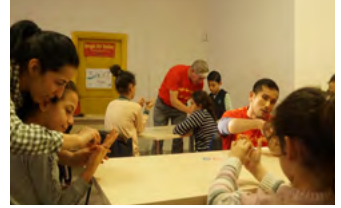
Syrian children, Istanbul - Support to Life